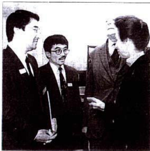
A thank you to the Princess and International Rescue