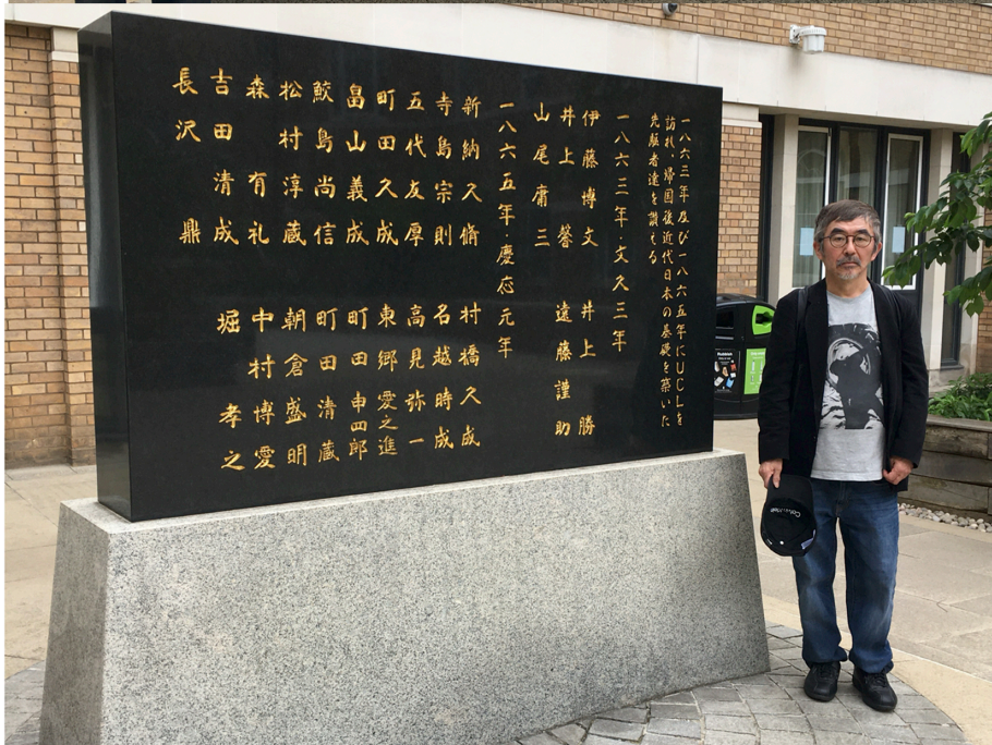
英国の UCL (ユニヴァーシティ カレッジ ロンドン) のキャンパス内にある この記念碑は、1863 年に同大学に留学した伊藤博文等の長州五傑等を讃えています。 UCL の総長はアン王女で、キング氏は王女と懇意な関係です。