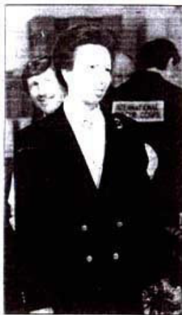
Princess Anne on tour